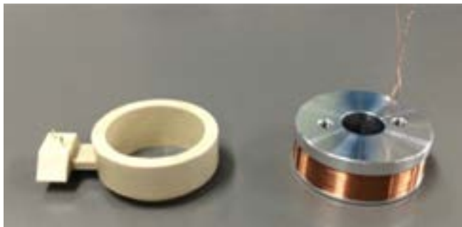
Left: Smart SHS's coil molded with LCP Right: SHS's coil